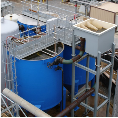
2 MGD Surface Water Filtration