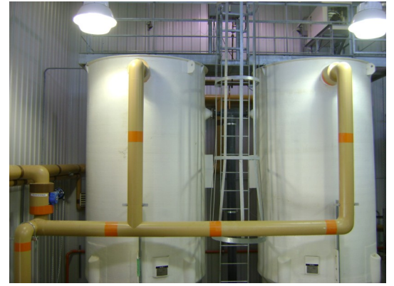
0.6 MGD Tertiary Filtration